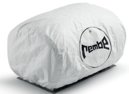
The sanitary cover protects the Q-Ball® S against dust from outside sources.